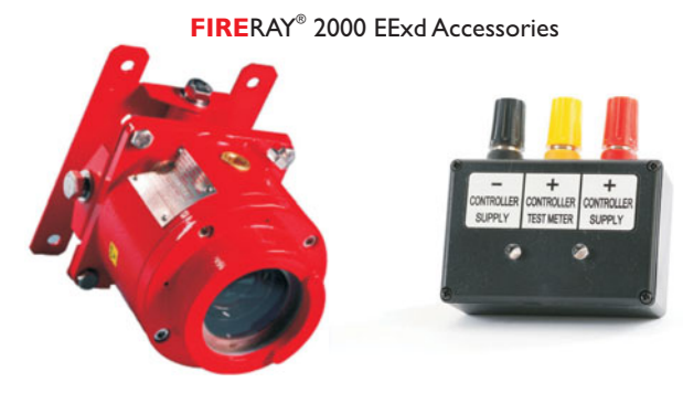
Optional Wall Mounting Bracket

On smooth ceilings up to 60 ft. (18.288m) between projected beams and not more than one half that spacing between a projected beam and a sidewall. Other spacing may be used depending on ceiling height, airflow characteristics and response requirements. See NFPA 72 for further information.