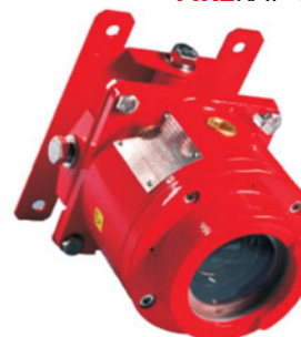
Optional Wall Mounting Bracket