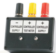
Alignment Aid Tool